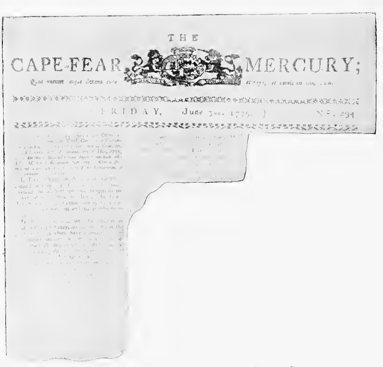
The spurious Cape-Fear Mercury, Friday, June 3rd, 1775.